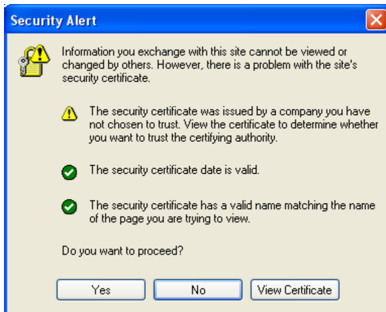
Figure 1 - Security warning

Note that the web protocol is https, not http – the 's' means 'secure'. The school uses a self-signed security certificate which might cause a security alert similar to Figure 1 to be displayed when accessing the Centre/SIS.